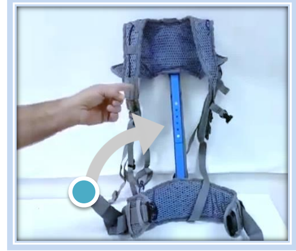
You are ready to go.... Enjoy!