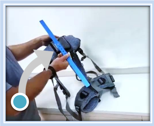
Adjust the length of the bar Using the screws.