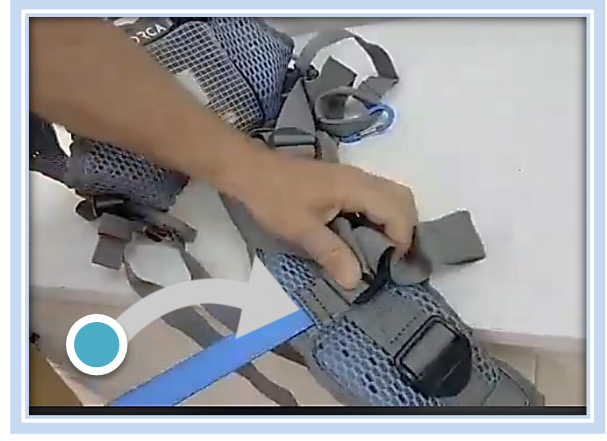
Use force to insert the Bar into the pocket